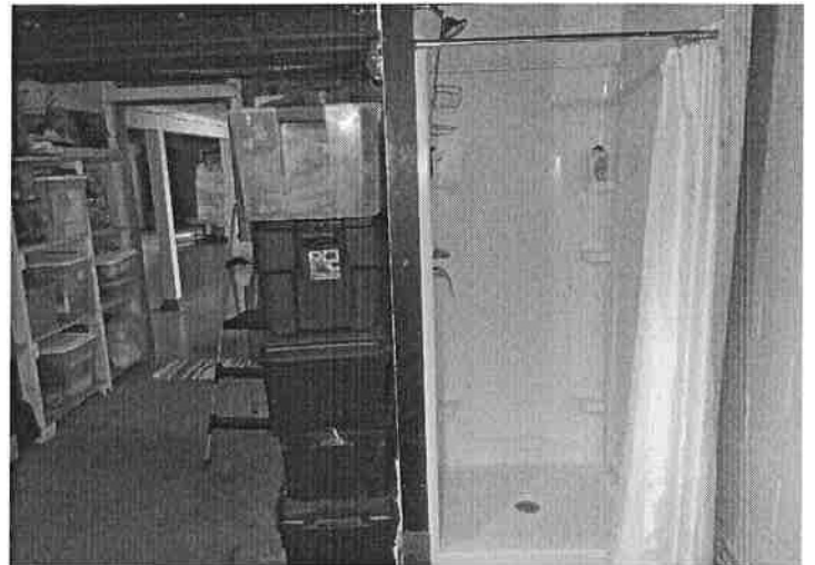
Separate shower in work area