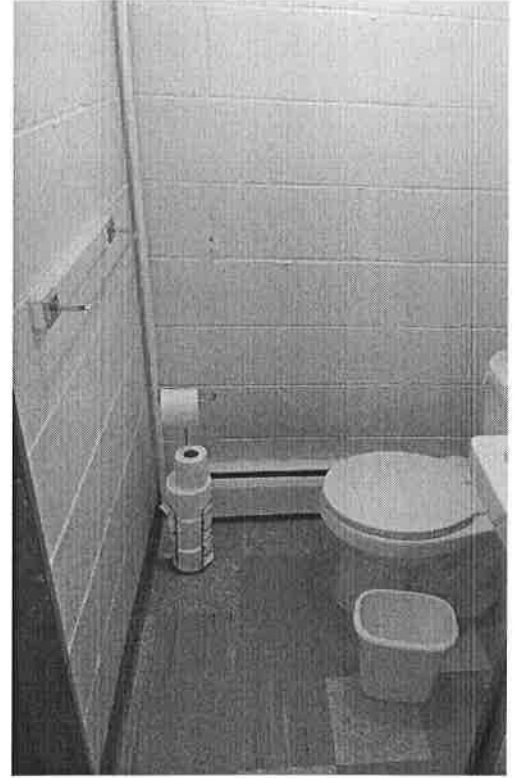
Sink and toilet