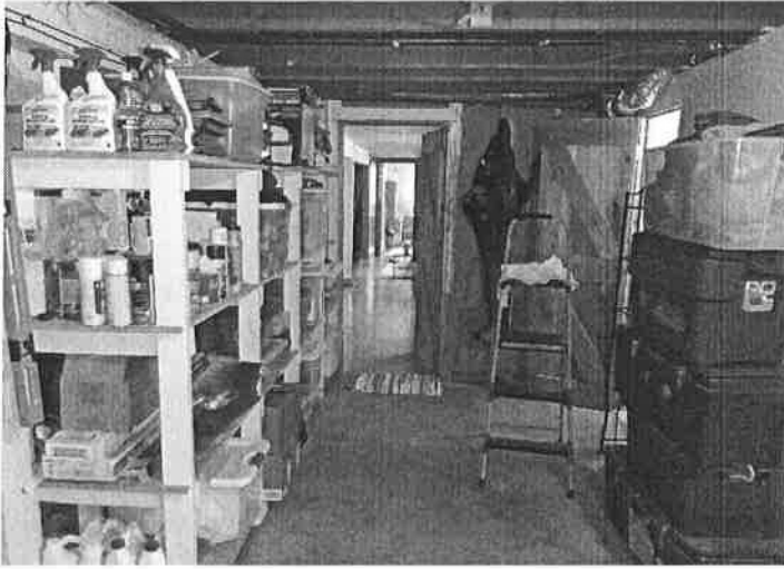
Bathroom on the right